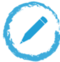
Food waste source assessment