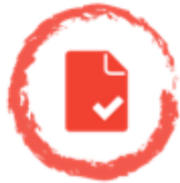
Overall food waste assessment

When it comes to doing a food waste assessment there are, generally, 3 types. All of these have as an underlying goal, the identification of the root causes of preventable food waste. The different assessments are: