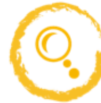
Detailed food waste assessment